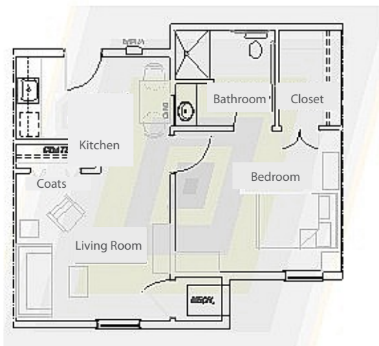
1 bedroom deluxe apartment (609 sq ft)