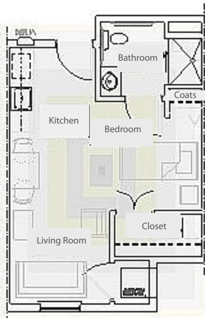
Studio apartment (385 sq ft)