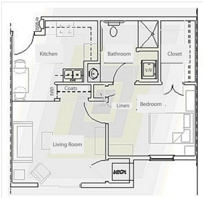
1 bedroom apartment (629 sq ft)

Living Room 13'7" x 12' Kitchen 12'6" x 9' Bedroom 12'7" x 10'8"