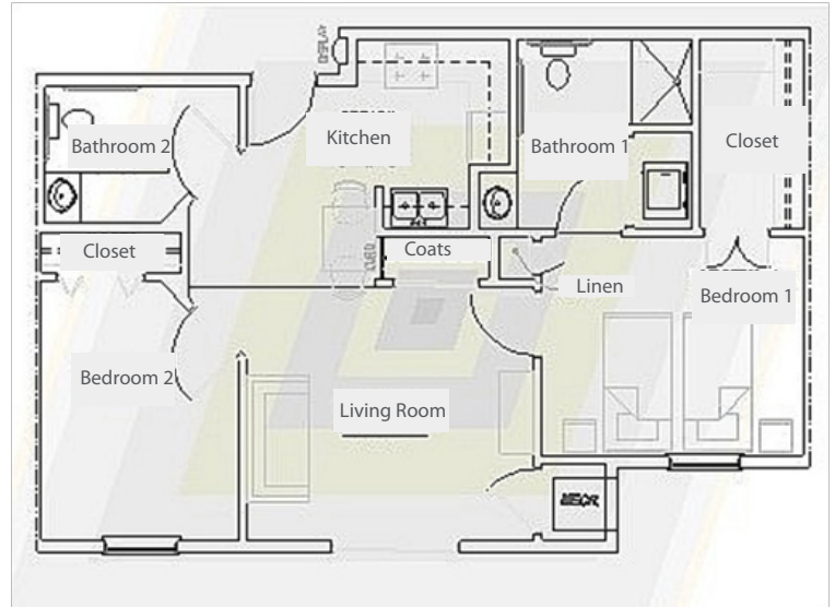
2 bedroom apartment (859 sq ft)

Living Room 13'9" x 12'1" Kitchen 12'7" x 7' Bedroom 1 12'7" x 10'6" Bedroom 2 9'6" x 12'3"